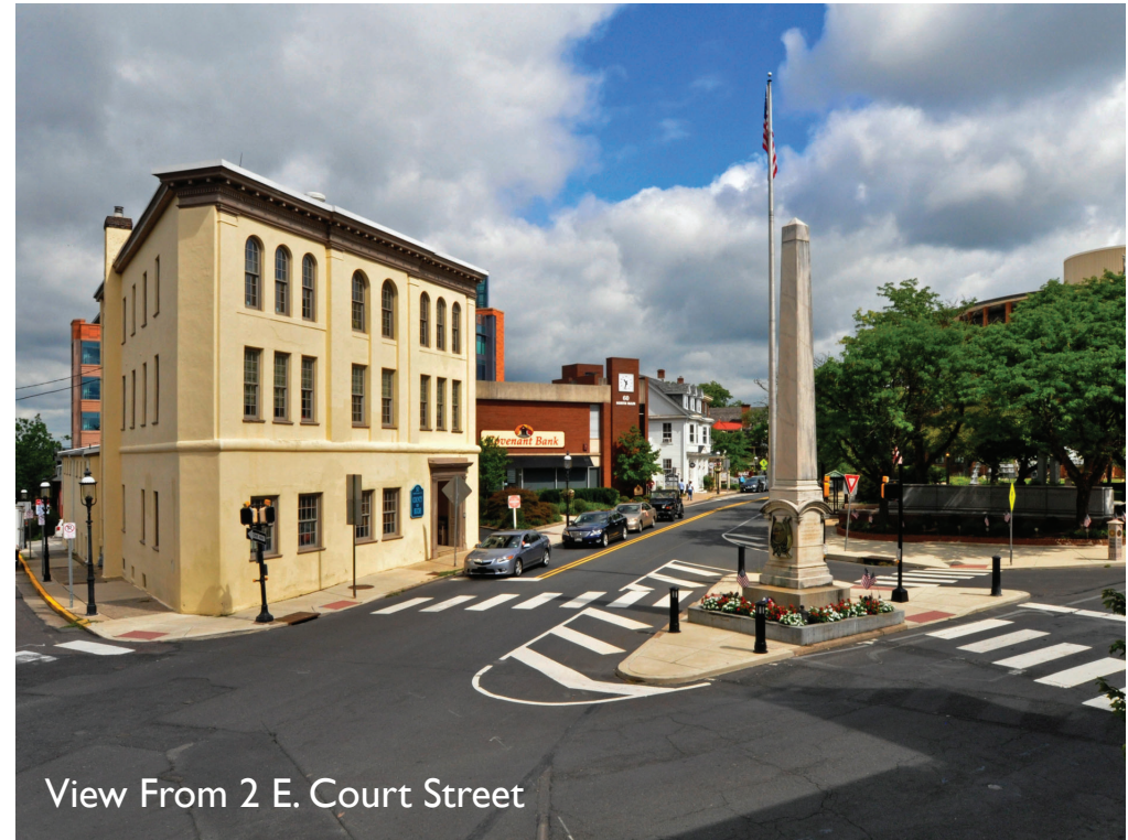
View From 2 E. Court Street