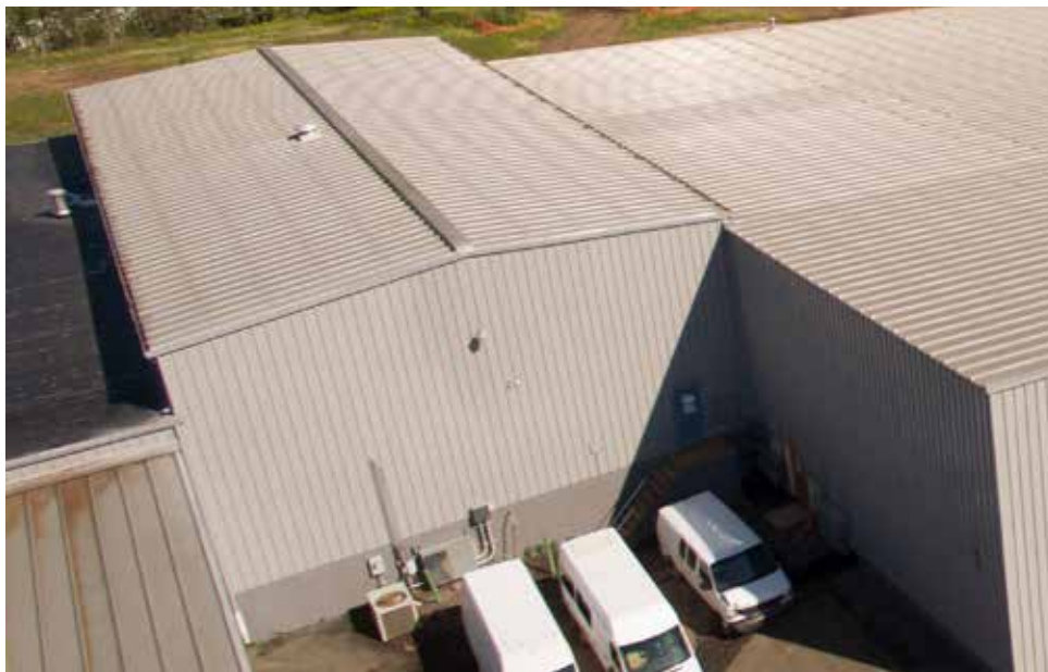
Building 4 - 6,000± SF