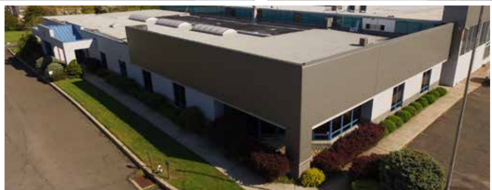
Office - 5,306± SF