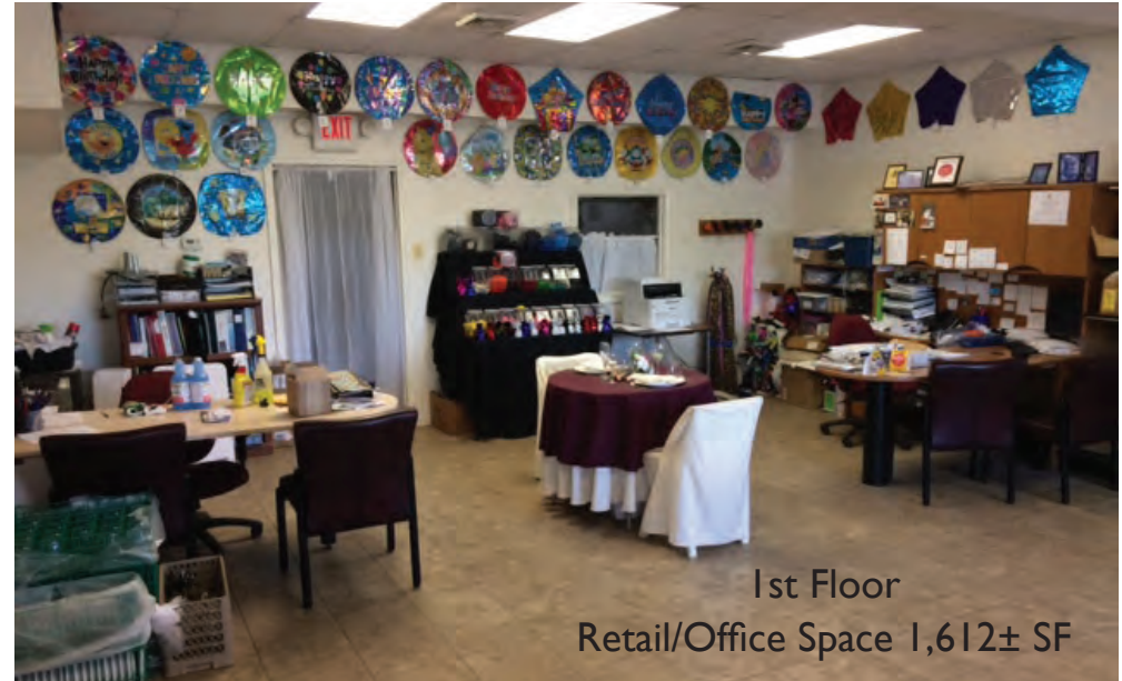
1st Floor Retail/Office Space 1,612± SF