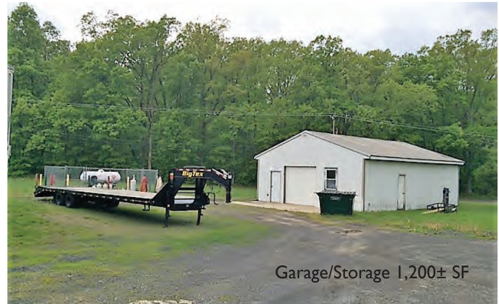
Garage/Storage 1,200± SF