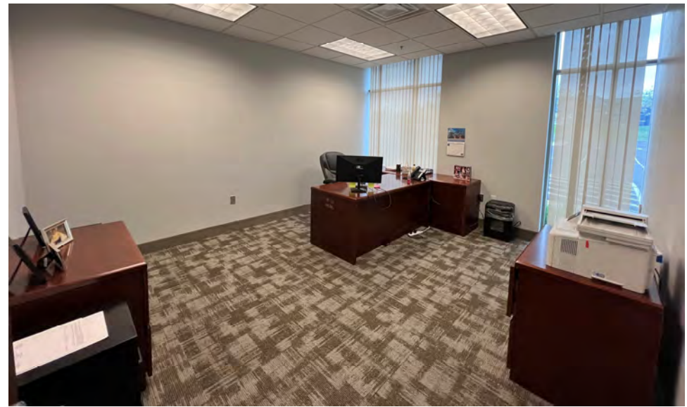
Suite 115 - 964± RSF