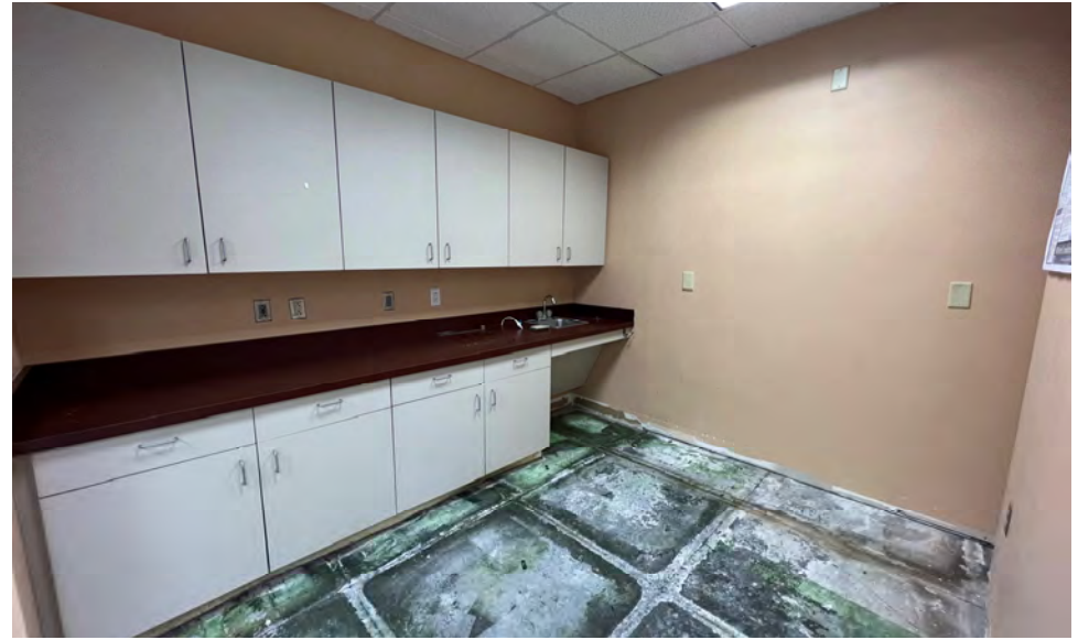
Suite 110 - 5,298± RSF (Tenant chooses carpeting)